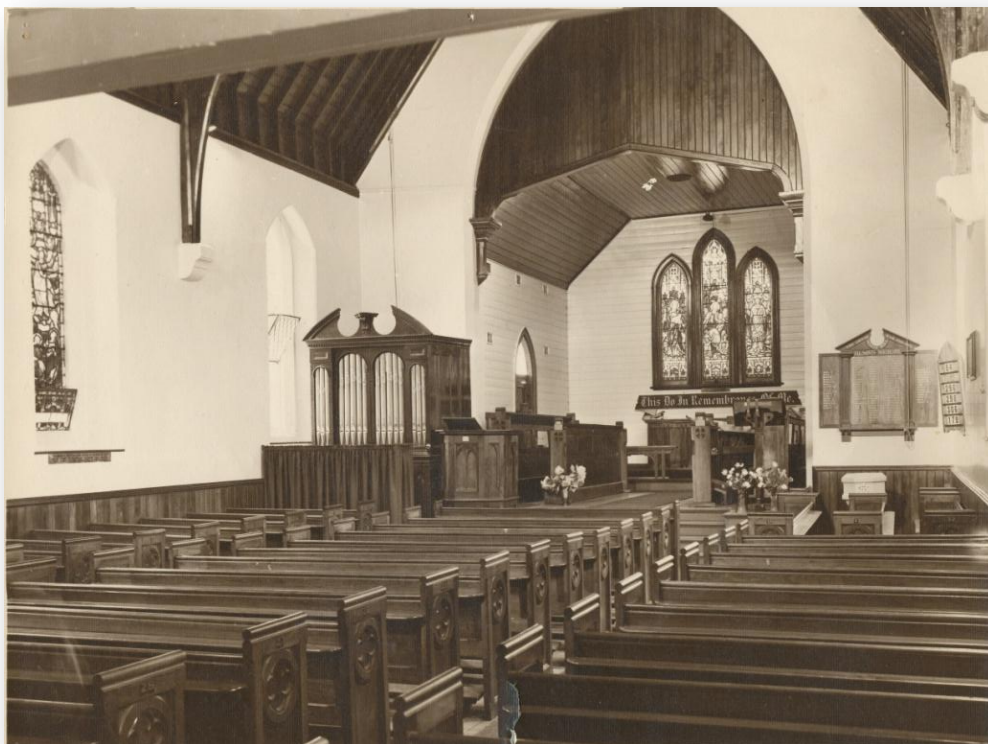
All Saints 60 years ago, in 1949, showing timber chancel, choir and pulpit. The organ was moved in the 1960s to its current place in the gallery.

It is also a mistake to think that buildings of the past were built to last and easy to maintain. Generations of churchwardens have worried about everything from the inadequate drains to the slate roof, which has undergone major works several times over. At one stage the external buttresses were declared unsafe by the Department of Health, and had to be re-mortared at great cost.